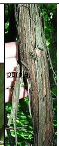
Shreddy bark of grape

Grape leaves can be lobed or unlobed; most often taper to a distinct point