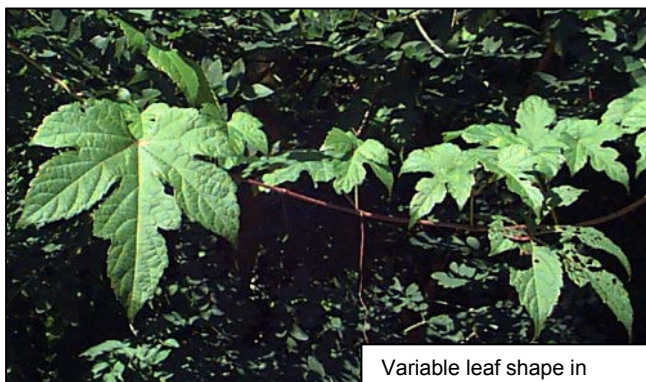
Variable leaf shape in porcelainberry. (Grape leaves are also very variable).