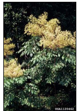
Devil's walking stick flowers overtopping foliage