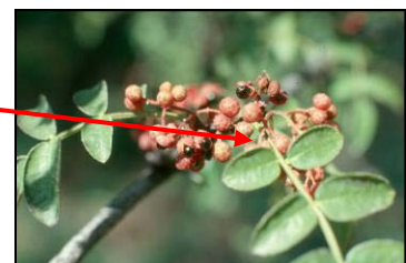
Toothache tree fruit and once-compound leaves