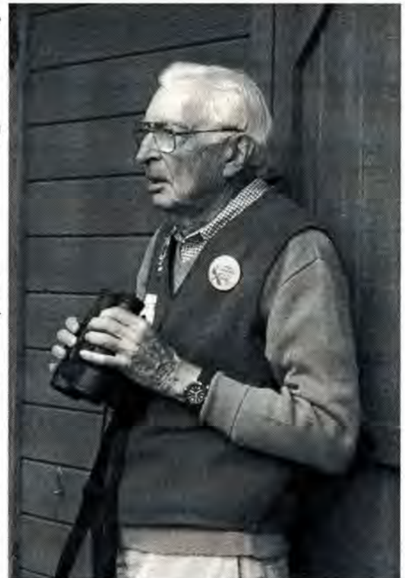
The author enjoying wildlife observation with his binoculars

There are several things to look for in the ideal instrument. The binocular should have a center focusing wheel, not individual eyepiece focusers. Eyeglass wearers should look for binoculars with sufficient eye relief, or distance between the eyepiece and the front of the eyeglasses so that they can see the full field. This should be at least 15 millimeters. Field of view is another important consideration. This value is