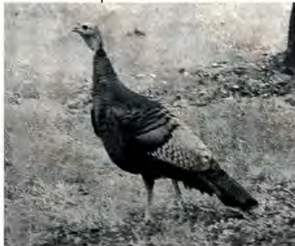
Hen turkey in alert posture

Turkeys will visit suburban feeders in the fall and winter.